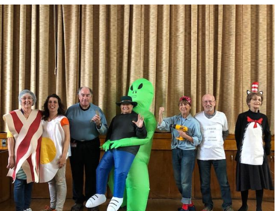
Halloween Celebration at Lunch & Learn