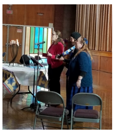
At the Community Hanukah celebration