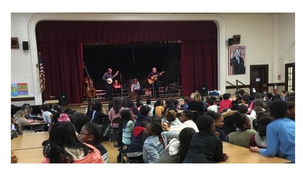
Concert at Morse School sponsored by the Social Action Coalition